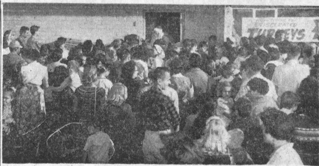
DOIN' WHAT COMES NATURALLY: Santa Christmas party last week at Clark's market in Claus passed out presents and kids crowded Walteria, corner Hawthorne ave. and Pacific in by the droves to receive them at a children's Coast Hwy.

WALTERIA CIVIC GROUP: Walteria Civic Organization will meet January 4, at 8 p.m. at the Walteria Recreation Center, 242nd and Ocean, for the purpose of electing permanent officers. Interested individuals are invited.