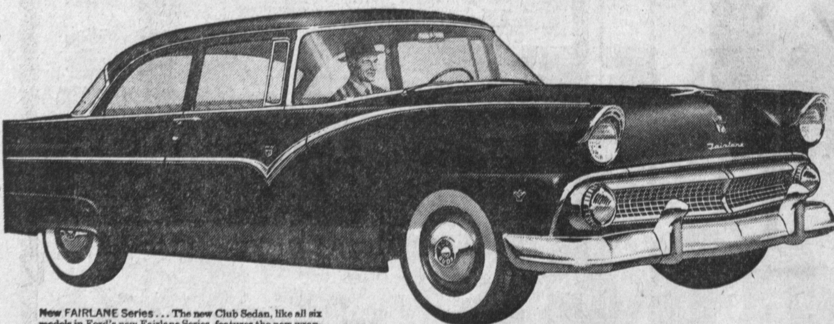
New FAIRLANE Series... The new Club Sedan, like all six models in Ford's new Fairlane Series, features the new wrap-around windshield, new luxurious interiors and wide choice of stunningly new, single and two-tone exterior colors.