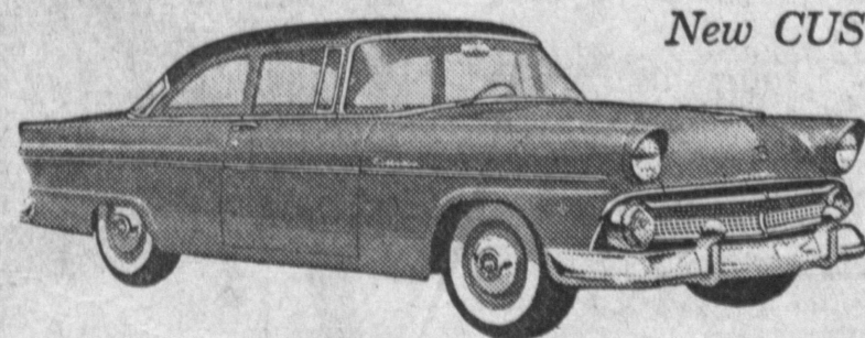
New CUSTOMLINE Series

The Tudor Sedan (at left) and Fordor offer a wide selection of exciting new color and upholstery combinations. Like all 1955 Fords, they have a new wider grille, new visored headlights and sturdier, extra-narrow pillar-posts for better visibility.