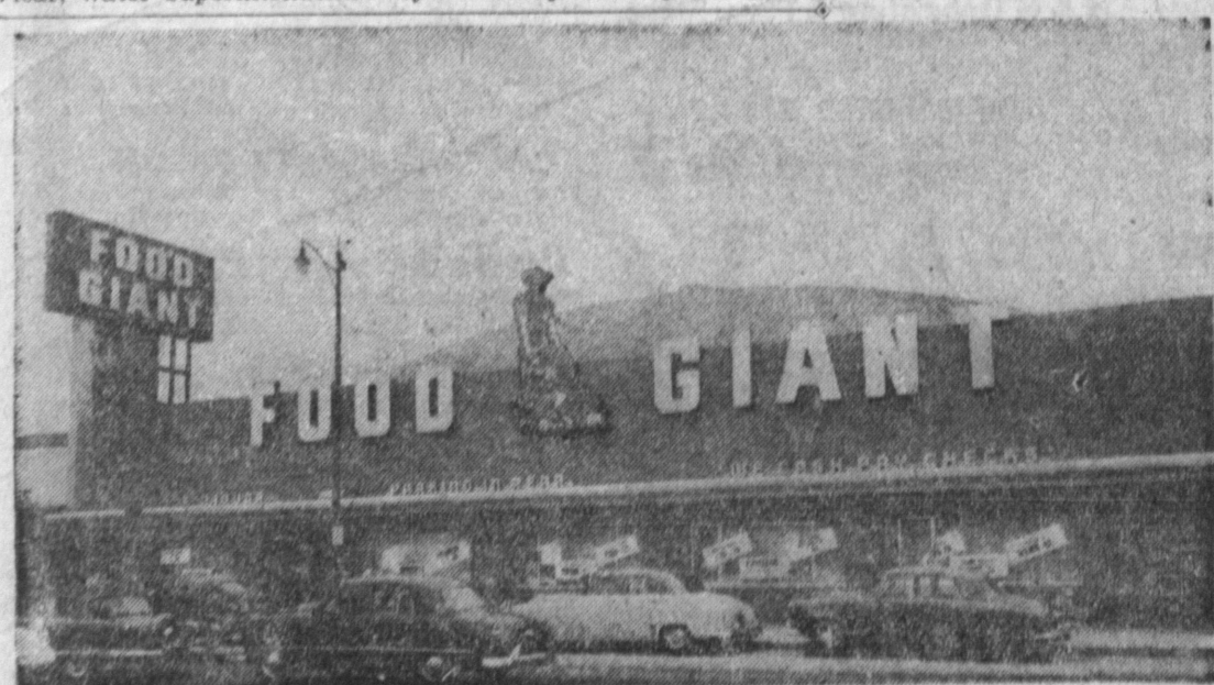
FOOD GIANT MARKET, 423 S. Hawthorne boulevard, Hawthorne, offers bargains galore, orchids, kiddie rides, birthday cake, balloons

Route Route of the drain will run (Continued on Page 25)