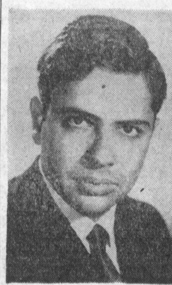
GARY GRAFFMAN ...

The first of a series of Joint Youth Band-Artists concerts will be given Monday night, November 15, in the Torrance Civic Auditorium at 8:15 p.m. Featured soloist who will play the second half of the concert is Gary Graffman, gifted young pianist.