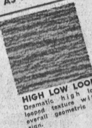
HIGH LOW LOOP Dramatic high low looped texture with overall geometric design.