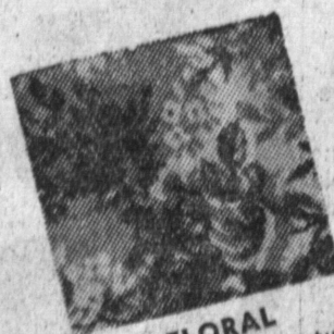
FLORAL Graceful 18th Century floral in muted shades.

BELOW ARE THREE MORE STYLES YOU MAY CHOOSE FROM AT THE SAME PRICE AS ABOVE.