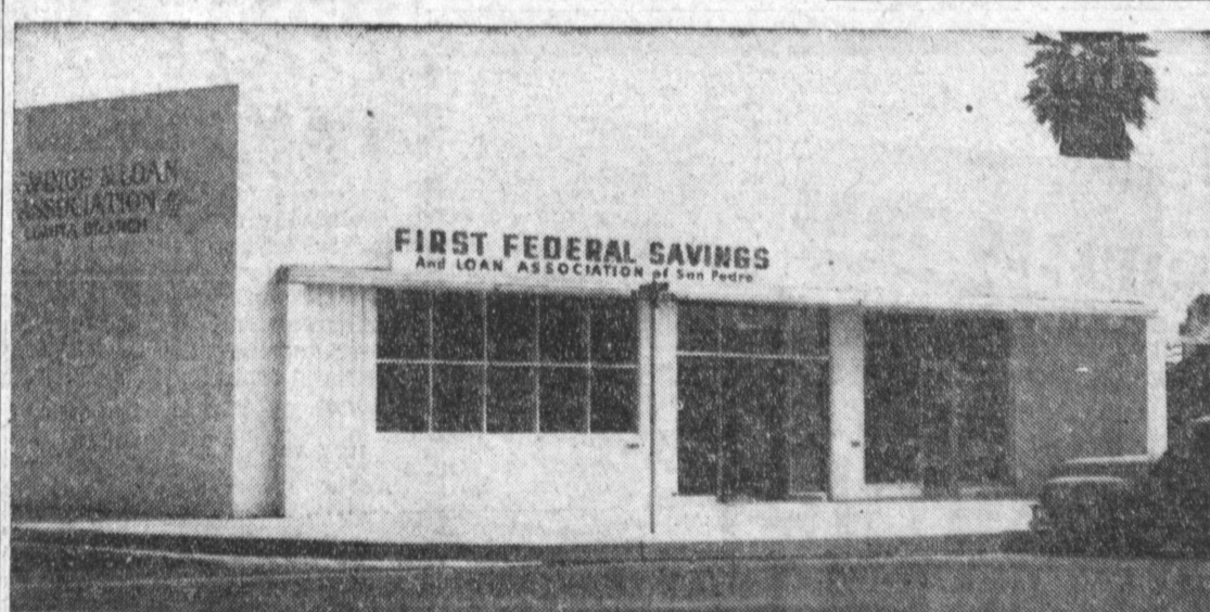
OPEN HOUSE... The new Lomita Branch of First Federal Savings and Loan Association of San Pedro will hold open house Friday, September 17 from 10 a.m. to 6 p.m. at 2233 West Lomita Blvd.