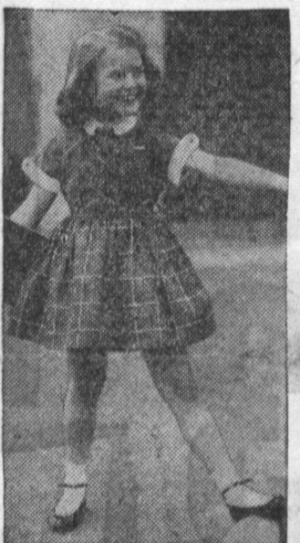
ALL SET FOR SCHOOL in this adorable plaid and plain shirtwaist with touches of crisp white pique at prim collar and cuffs for the 3 to 6-year-old.

For early fall's warmer weather, the smart dark cottons in plaid, check, or woven weaves are popular with the young set as well as their mothers. These cottons don't spot so easily as the plain colors, and most of the new cottons require little ironing. The only soil catcher might be the touch of white at the collar or cuffs, but these touches add so much sparkle, they are practically indispensable.