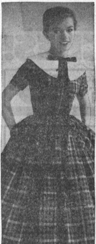
CRISP PLAID CHARMER, Puritan-collared with velvet ribbon tie and hold everything side pockets is available in teen sizes, with Advance Pattern 6381.

School days are back again, and the careful and proper selection of the back-to-school wardrobe will help boost the self-confidence as well as the interest and enthusiasm of the young student.