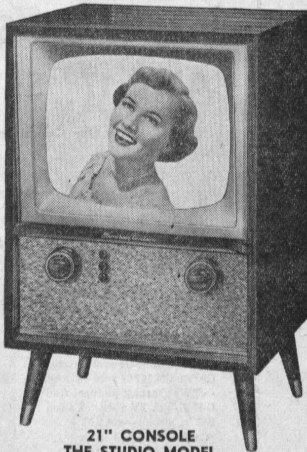
21" CONSOLE THE STUDIO MODEL