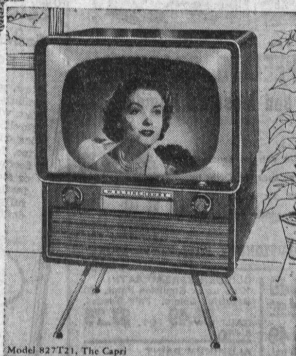
Model 827T21, The Capri