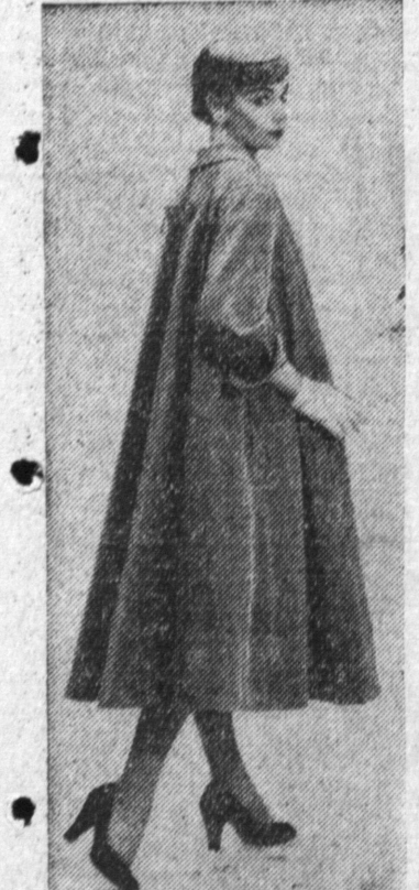
FULL COAT of Velveteen is shown in one of the many variations of this versatile fall fabric. This coat, double-breasted, emphasizes the prim "little girl look."

Accessories Handbags, hats, belts, and even gloves will be among the accents of color in the velveteen lineup. The velvet cummerbund will be seen cinching the smartness of many jersey and tweed dresses and jumpers... the hats will have an affinity with all the exciting new lines and colors... soft, head-hugging cloches... little caps... wide-brimmed bretons... draped and "shaped" berets... turban variations... and if it becomes you, the exaggerated planter and the outsized fedora.