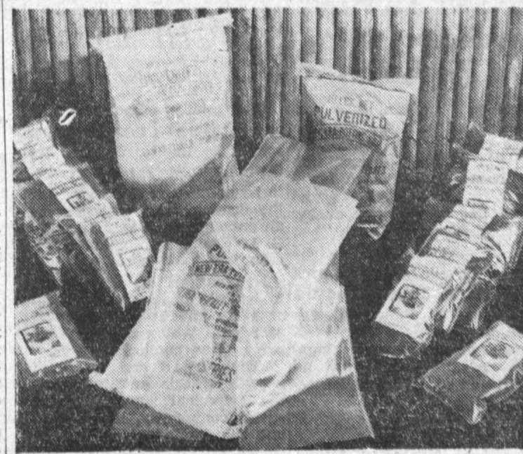
WONDER PLASTICS... The new Torrance plant to be built by Carbide and Carbon Chemicals Company, will manufacture basic materials for the plastic industry. The plant will produce polyethylene which is used to make bags such as the above. The bags are used for packing human and potting soil. They maintain the moisture content, accept printing, and are reusable.