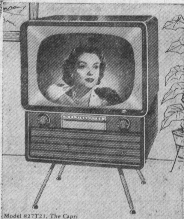
Model 827T21, The Capri