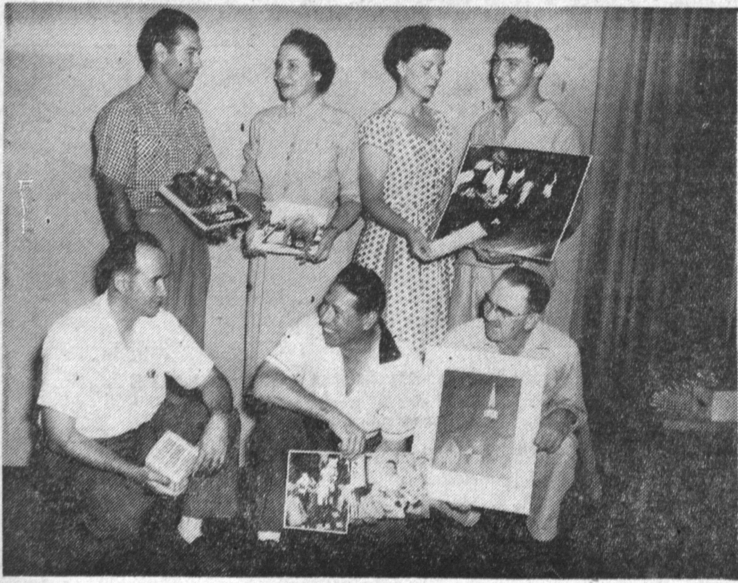
Photo Contest Winners