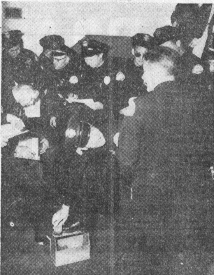
CROWDED: Petitions calling for a special bond election are being circulated now. The bonds would provide a new police station, among other things. Above is a view of the crowded conditions in the present station.

A new attempt is being made to obtain a new civic center, police station, and swimming pool in the city of Torrance.