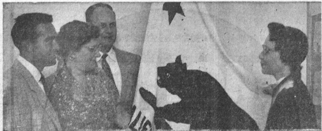
GIFT... Walteria elementary school was presented with a California flag last week by the Native Daughters of the Golden West, San Pedro chapter. Making the presentation was