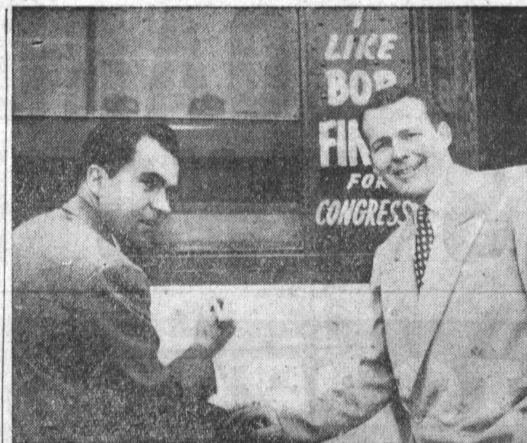
VICE-PRESIDENT RICHARD NIXON (left) signs "I Like Bob Finch For Congress" list on the side of Finch's traveling headquarters. Finch (right) will cover entire 17th Congressional District in the renovated bus before the June 8 primary elections.

Picture Framing • CUSTOM WORK • WOOD FRAMES • PAINTINGS & • PHOTOGRAPHS PHOTO ARTS STUDIO 1311 Post Ave. FA. 8-2830