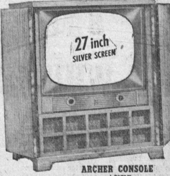
ARCHER CONSOLE L2879E