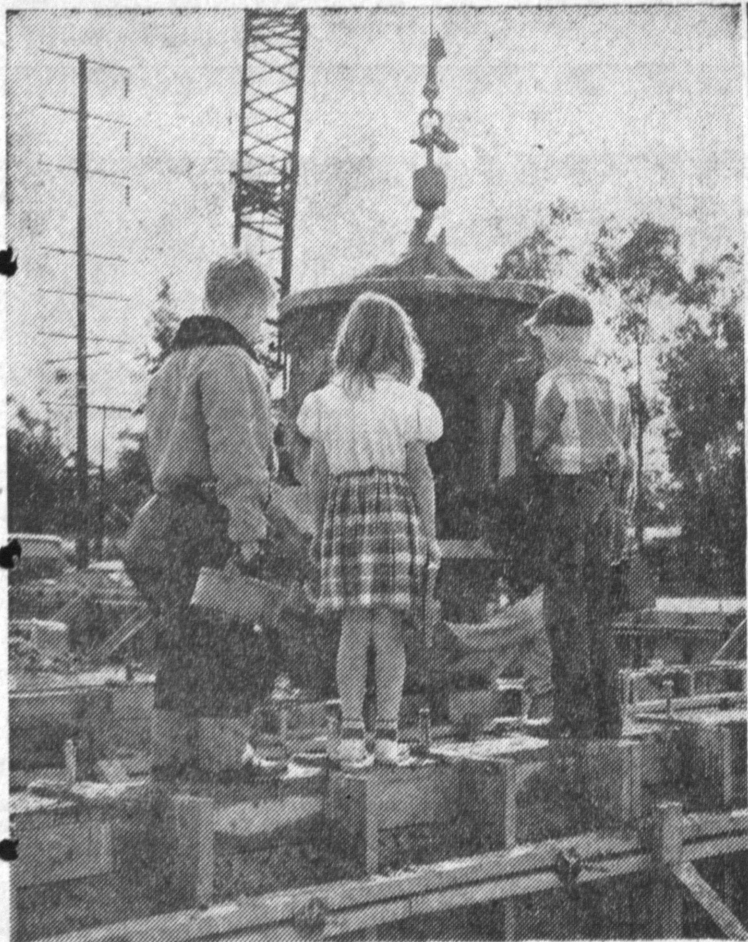
SIDEWALK ARCHITECTS: Three Dolores Street School children help supervise the construction of the new school auditorium. Twenty-two classrooms, an auditorium, and a cafeteria are to be completed by August 15.