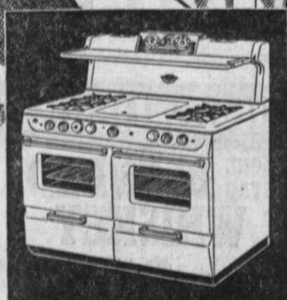
The new GAFFERS & SATTLER "CP" Automatic Gas Range, one of many makes with oven clock control offered in this campaign.