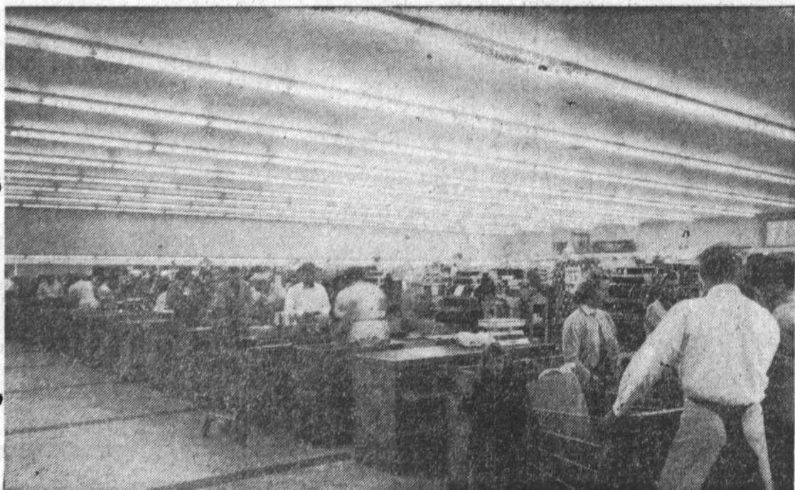
"SPECTACULAR" is the word for the interior of the new Food Giant market, 423 South Hawthorne boulevard, Hawthorne, which opens this week-end. The largest market in this area, and one of the largest in all of Southern California, the Food Giant has fourteen checkstands through which customers may rapidly checkout their purchases. The interior has been "color

engineered" by an outstanding Los Angeles decorator so that shopping is a pleasant experience for each customer. Tuneful melodies are broadcast throughout the store for customer-enjoyment. A beautiful 50 square foot photomural is part of the decor of the self service meat department.