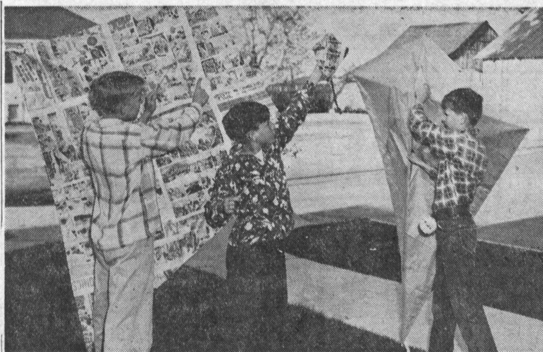
"I BETCHA IT WILL" . . . Actions will speak louder than words when these models are put to the test in Torrance Park at 2 p.m. this Saturday. There'll be kites all the way from six