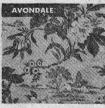
FLORAL BOUQUET with scenic background. White, gray, green, gold.