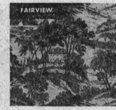
FAIRVIEW—Scenic pattern—White and natural.