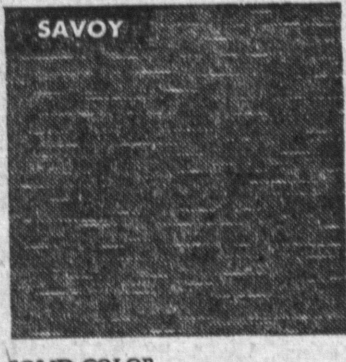
SOLID COLOR with textured effect. Wine, green, gold, gray, rose.