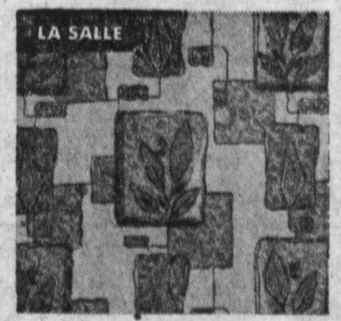
LA SALLE—Modern block—White, gray and natural.