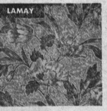
POPPY FLORAL with textured effect background. White, gray, green.