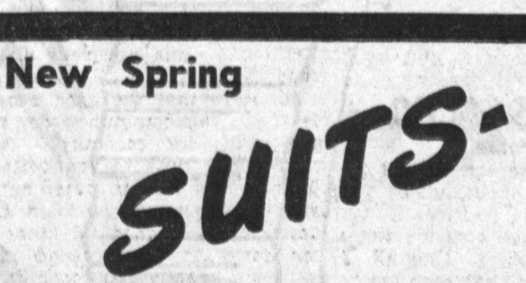
100 hand picked suits tailored and styled in a tremendous array of colors and fabrics. Don't miss this value. Reg. 22.99. Sizes 10 to 18.