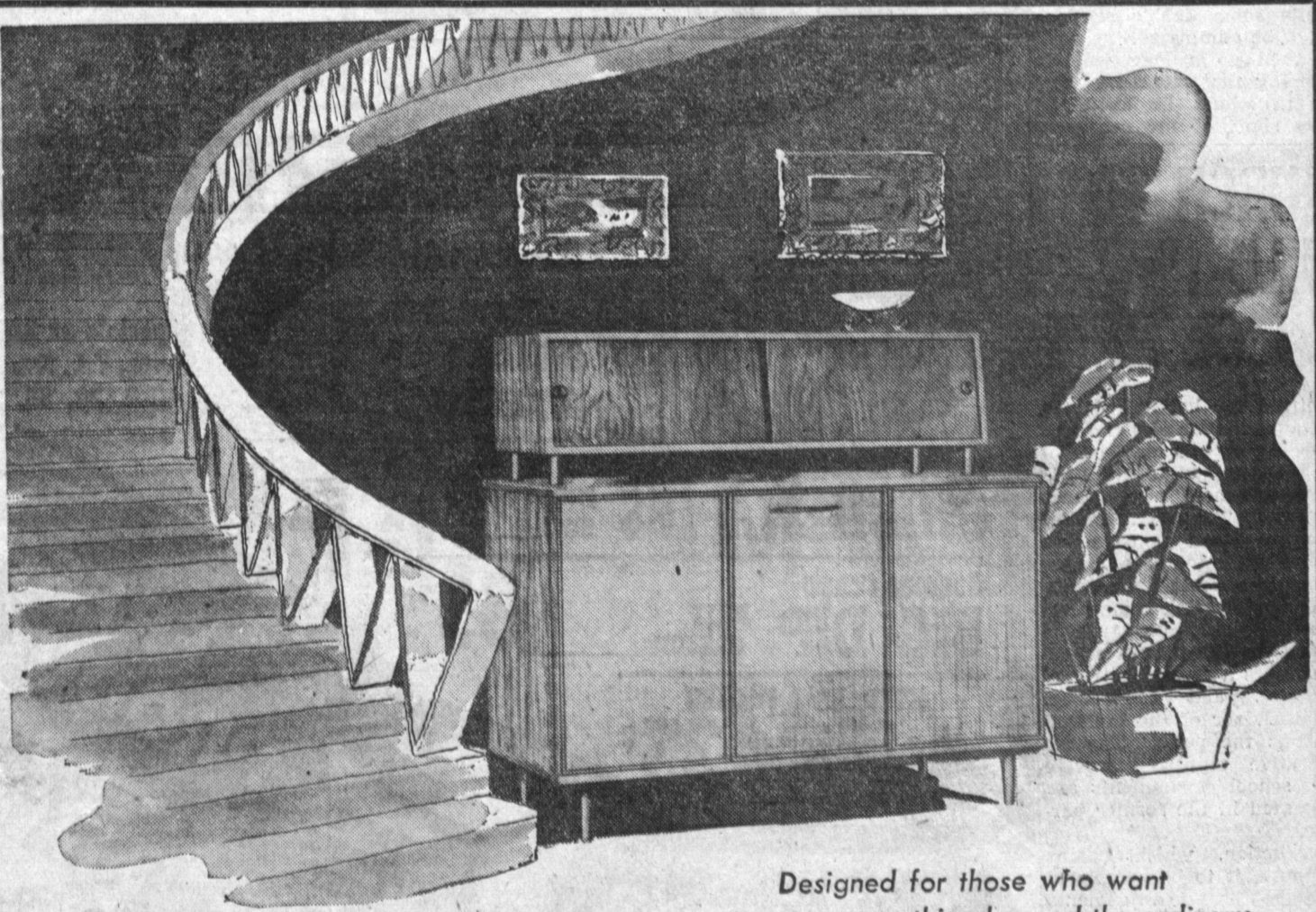
Designed for those who want something beyond the ordinary