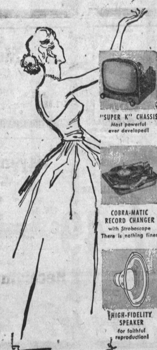
"SUPER K" CHASSIS Most powerful ever developed!