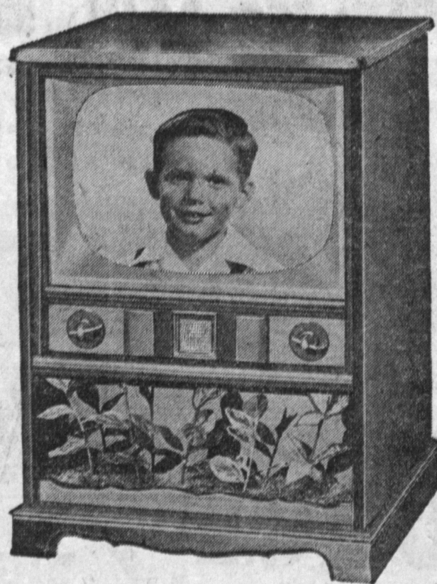
21" MAPLE PLANTER FRONT CONSOLE