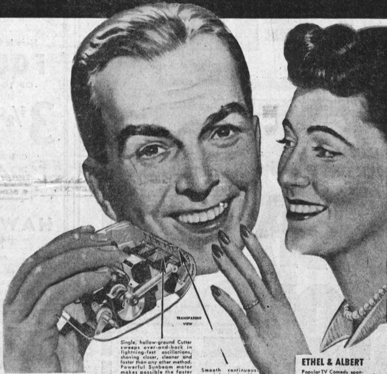
Single, hollow-ground Cutter sweeps over-and-back in lightning-fast oscillations, shaving closer, cleaner and faster than any other method. Powerful Sunbeam motor makes possible the faster shaving action you get with the famous Shavemaster.

If you own an obsolete or unsatisfactory electric shaver of any model, regardless of make or shape, we will give you $5.00 on the purchase of a new Sunbeam Shavemaster. You can see for yourself that you will receive closer, cleaner, smoother shaves than any other method, wet or dry.