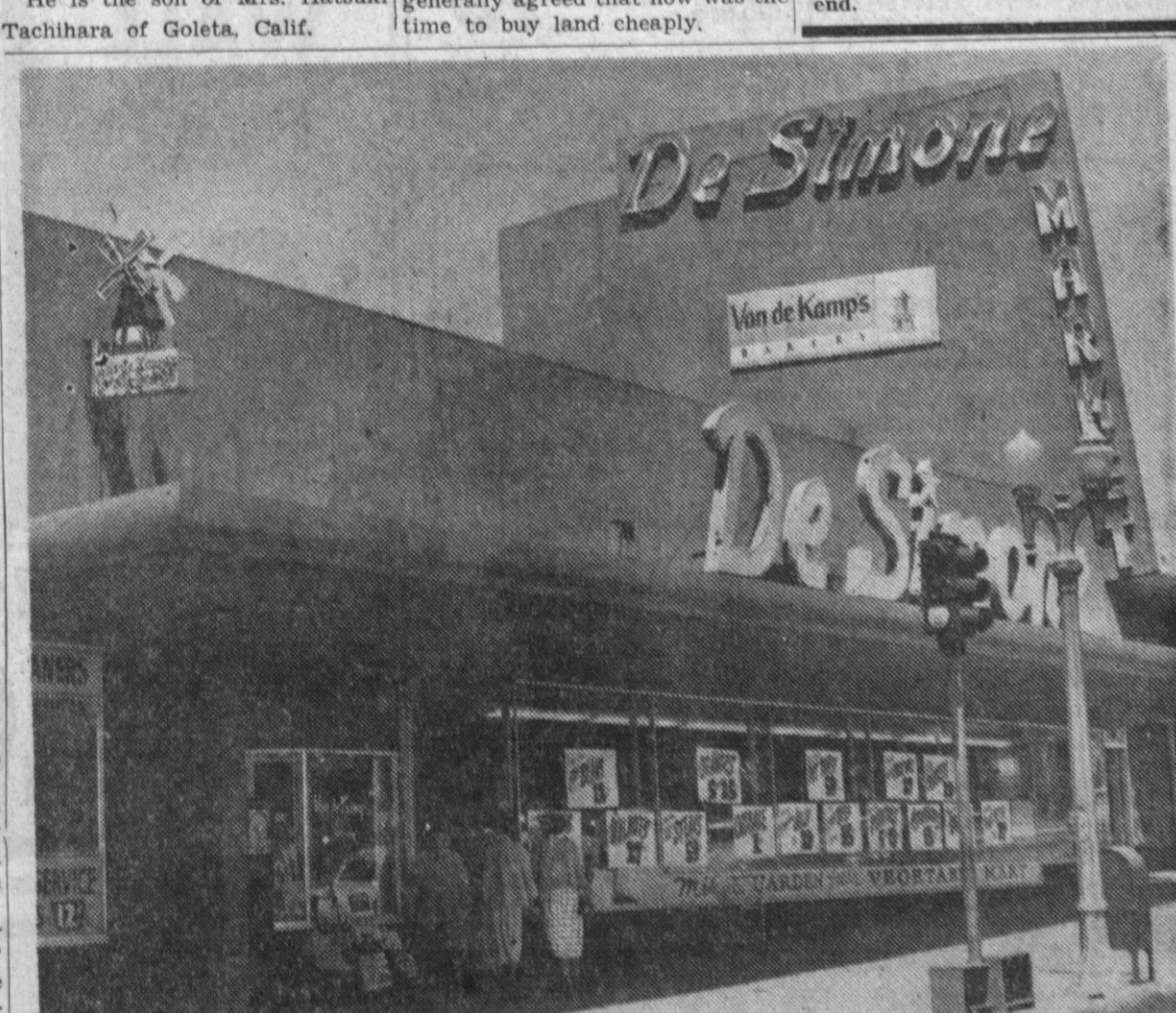
DE SIMONE'S MARKET, conveniently located at 701 N. Pacific Coast Highway in Redondo Beach, this week will begin bringing their advertised grocery, produce and meat specials to Torrance residents. Noting the rapid growth of the western section of Torrance, the market has instituted a policy of presenting their budget buys to local shoppers. De Simone's market ad appears on pages four and five.

3:30 p.m. The minimum tempera- The story is one of a convicted ture for yesterday was 54 degrees. murderer who refuses to reveal his