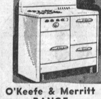
RANGE A Genuine CP Range -Full Size Oven and Storage Space, Full 36 - inch, with Grill.