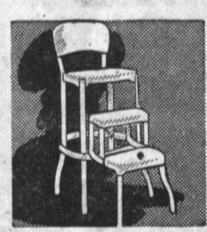
Cosco Step Stool A practical stool. Two steps swing out. Durable enamel in white with gay

$ 775 50c Down • 50c Week 50c Down • 50c Week