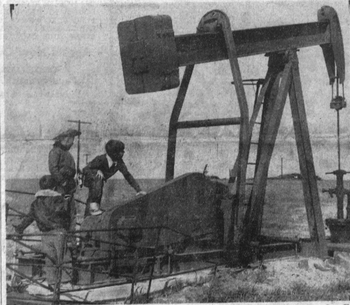
ACCIDENT AHEAD-Three Torrance youngsters unconcernedly play around an operating oil well, aware of the tremendous danger that exists on the machine. Recently a seven-year-old boy was badly injured playing about an oil pump just as these children are doing. Unless the city passes legislation demanding steel safety fences around these wells, more accidents of this nature are bound to occur.