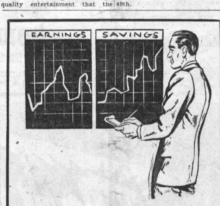
Chart Your Way to Success!

this show will bring the same high Guard divisions - the 40th and