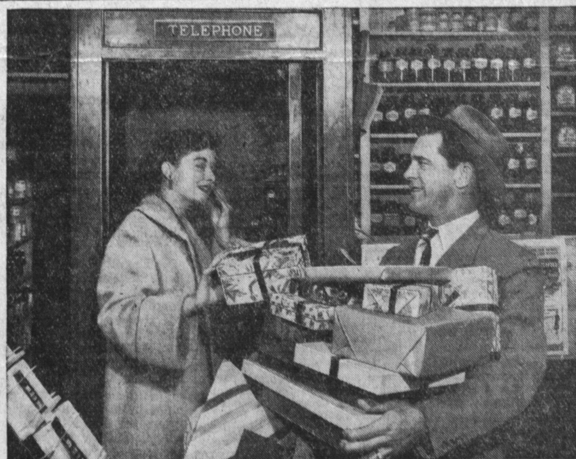
This veteran public telephone installation at the corner of Alvarado and Franklin in Monterey, California, has been busy serving the public since 1930.