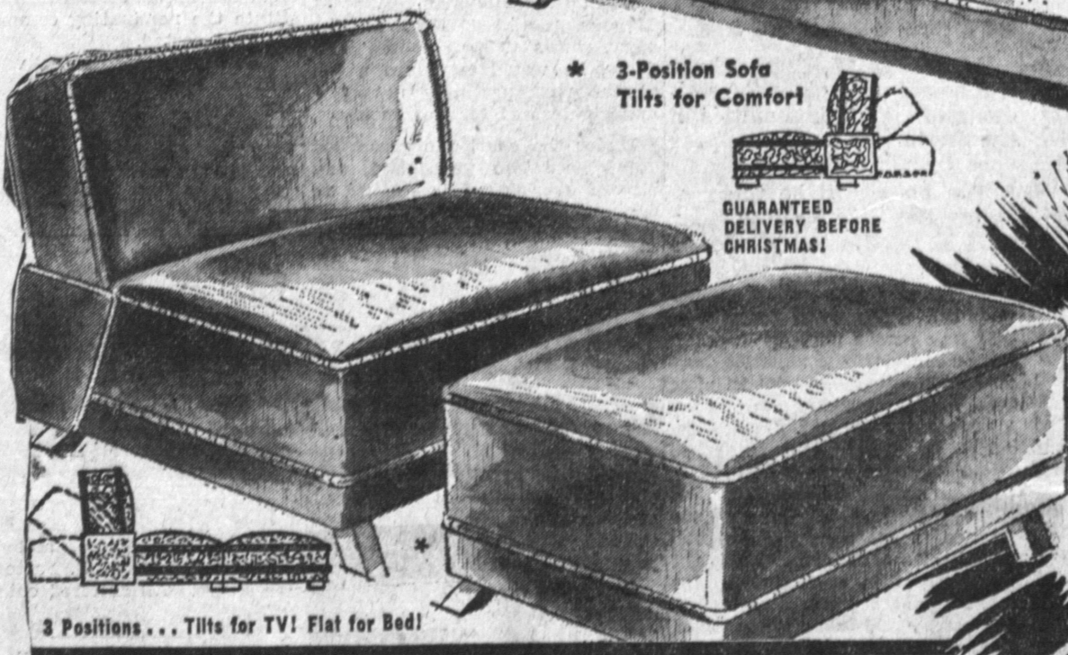
3 Positions... Tilts for TV! Flat for Bed!

Your Choice BED DIVAN OR BED, CHAIR and OTTOMAN $69 88 *