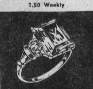
Ladies' Birthstone Rings