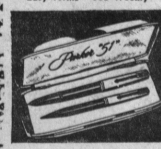
PARKER PENS & PENCILS