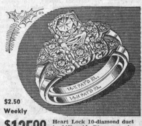
in 14K gold. Rings may be worn together or separately.

BUY NOW FOR CHRISTMAS - PAY NEXT YEAR - NO CARRYING CHARGE - No Extras