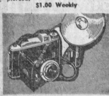
FOLDEX "20" CAMERA Complete with films, 2995 bulbs, flash unit batteries, case, instruction book.

By Sunbeam, it whips, 4650 it mixes, the gift for the