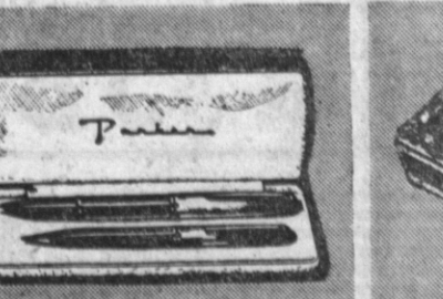
Parker Pen & Pencil Set Select now for gifts, for From $1.00 Weekly