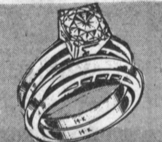
DIAMOND BRIDAL SET Beautifully matched in $100 14K yellow or white gold. Solitaire styling. $2.00 Weegly