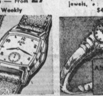
BULOVA Bracelet watch. Ideal gift for her. $1.00 Weekly