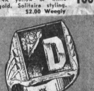
Diamond Onyx Initial Ring Mounted in IOK gold- 199