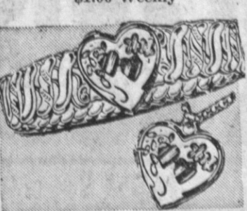
Heart Locket & Bracelet In natural gold color, beautifully gift boxed.