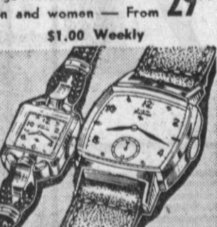
ELGIN WATCHES Great selection : 17 lewels 3375 with the unbreakable main