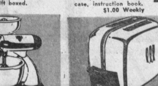
TOASTMASTER Automatic "pop-up" toaster. Perfect toast $1.00 Weekly