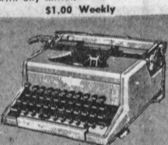
Remington Portable "Miracle Tab" portable 10037 typewriter & carrying case. Fed. tax extra. $2.00 Weekly