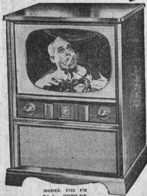
MODEL 2723 FM 21-in. $339.95 Includes Installation and Parts Warranty