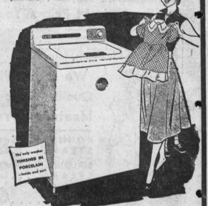
The only number FINISHED IN PORCELAIN inside and out!