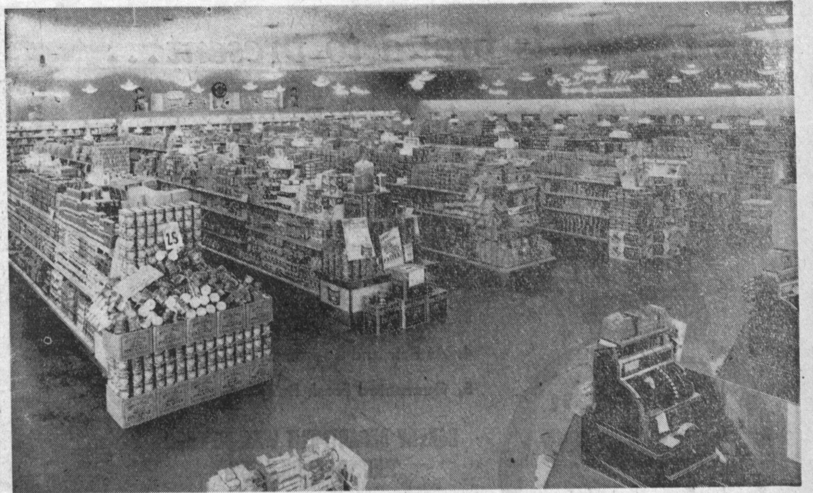
THE NEWEST AND LATEST IN MODERN SUPER MARKET GROCERY DEPARTMENTS IS SHOWN ABOVE IN THE NEW JIM DANDY MARKET—DISPLAYING OVER 4900 DIFFERENT ITEMS FROM APPLE SAUCE AND AMMONIA TO ZWIEBACK AND ZUCCINI.