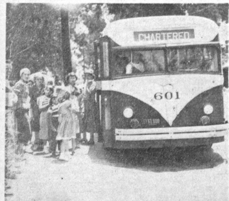
CIRCUS BOUND —More than 200 local children were the guests of the Torrance El Toga Shrine Club last Friday at the annual Shrine Circus held in Los Angeles. Above the children are boarding a bus, sponsored by the Shrine and the Torrance Recreation Dept., which transported them to the circus.