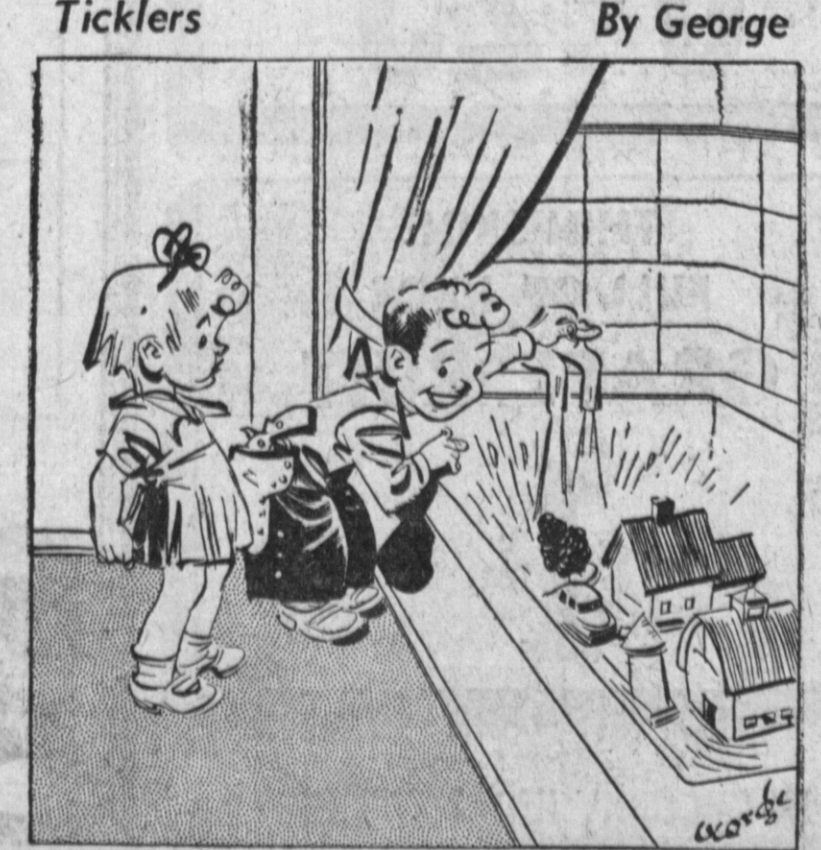
"What a dandy place to have floods!"