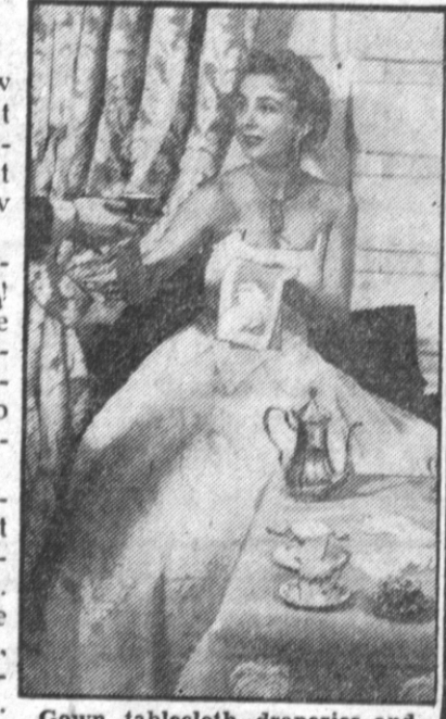
Gown, tablecloth, draperies and window shades, right, show the versatility of modern organdy with a permanent finish.

cloths and napkins, in high ion news. Some look like fashion designs for late-day seersucker, others resemble wear. The pattern stays in bamboo. Colors are pastel or through cleaning or hand earthy, the latter including variations on the many bril-