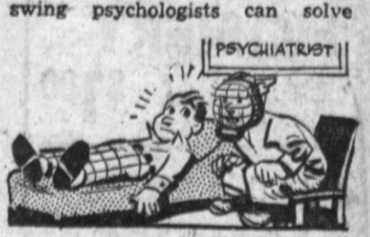
many cases just by pointing to the home team's losing streak.

up the hammock. With the baseball season in full'