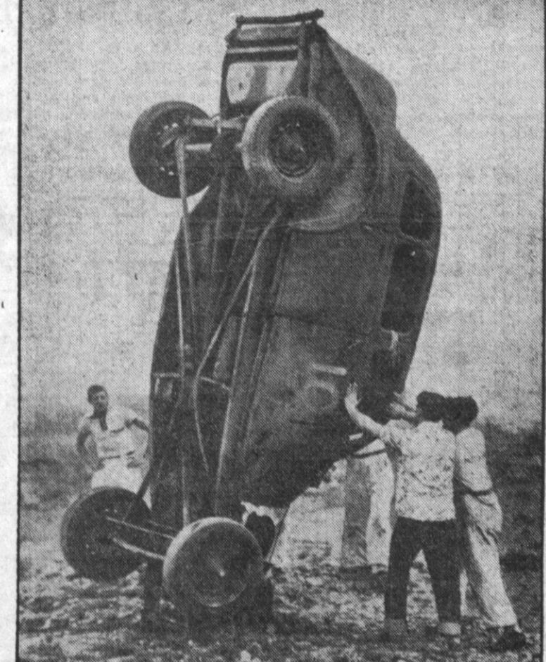
STOOD UP-Arley Ward's hot-rod racer came to an undignified halt in this perpendicular position during stock car races at Soap Lake near Seattle, Wash. A trifle shaken, Ward climbed out unhurt.