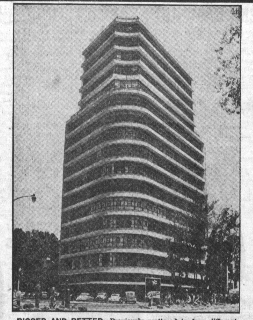
BIGGER AND BETTER-Previously scattered in four different buildings, the U. S. Embassy in Mexico now occupies this modern 17-story structure on the Paseo de la Reforma in Mexico City. The only U. S. Embassy in the world larger than this one is in England.