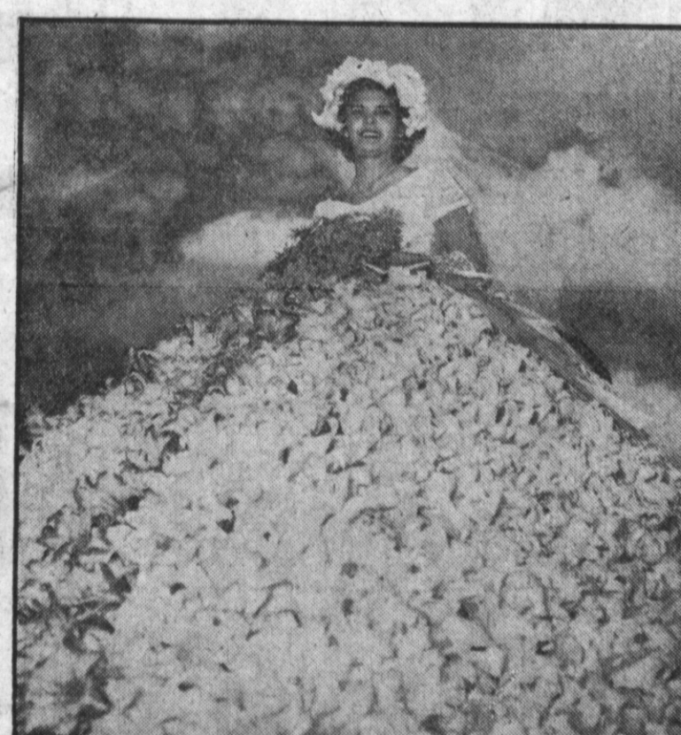
MAID OF LILIES—Paying honor to the Bermuda hily, a "Lily Bride" with a skirt resembling a mountain of flowers rides on Bride" with a skirt resembling a mountain of flowers, rides on a float in the third annual pageant honoring the native flower. More than 40 similarly decorated floats wound through the streets of Hamilton, Bermuda's capital city, during the celebration,