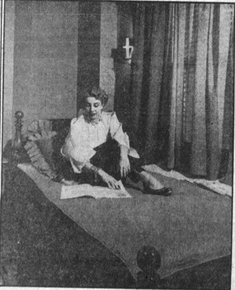
Casement organdies that liant shades of springtime Tailored organdy bedspread, pillow sham and draperles bring twotone texture interest for modern bedr

cloths and napkins, in high ion news. Some look like fashion designs for late-day seersucker, others resemble wear. The pattern stays in bamboo. Colors are pastel or through cleaning or hand earthy, the latter including variations on the many bril-