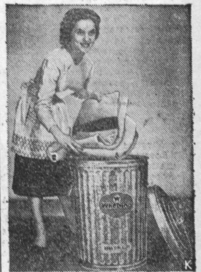
TIP FOR SPRINGTIME —Where to store blankets safely through the summer is a problem every housewife faces in the spring. Stored in closets or portable wardrobes, bulky blankets take a lot of room, often fall prey to moths. Here's a good solution. Put cleaned blankets in a new galvanized rubbish can and keep it in the attic or basement. A paper seal between the lid and the top of the can keeps out moths and dust. Quality ware, with durable galvanized coating, is inexpensive and will last for many years as a moisture- and rodent-proof storage container.