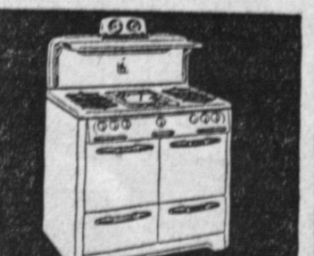
Among the many makes of gas ranges on display during Spring Showing is this beautiful new

The best way to enjoy the many exclusive advantages of gas is in a new automatic gas range. See the new models at dealers' or your Gas Company. Look for the one that fits your family needs. You'll find that it costs less to buy, less to operate.