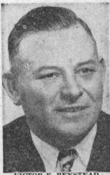
The "B" in BID Ticket

TORRANCE, CALIF., THURSDAY, APRIL 3, 1952 54 5c Per Copy