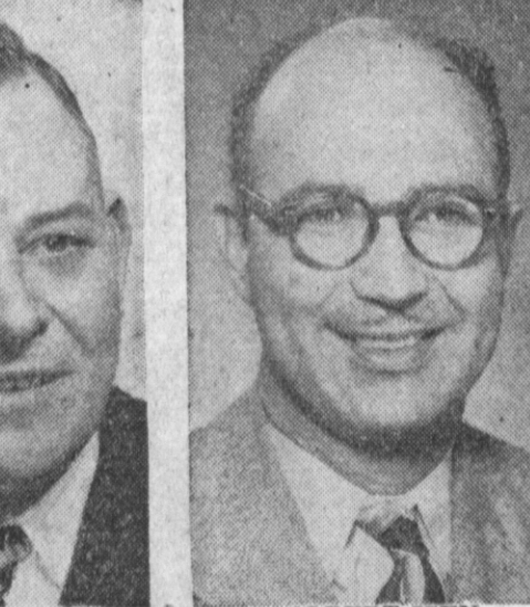
Lawyer in BID Trio