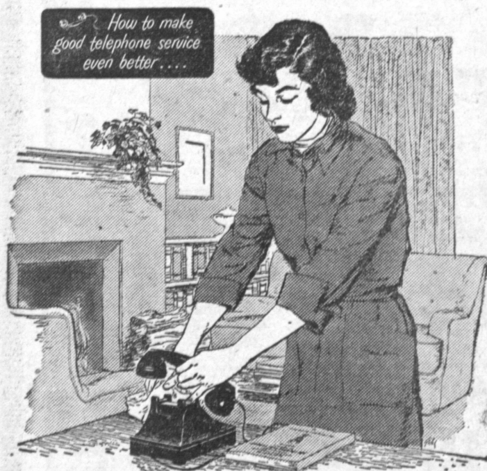
How to make good telephone service even better....