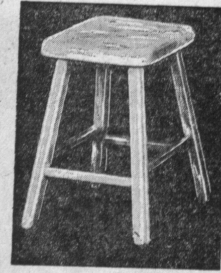
18 Inch STOOL A utility stool that will serve a purpose in any room. Full 18 inches high. Ideal for reaching high cupboards.