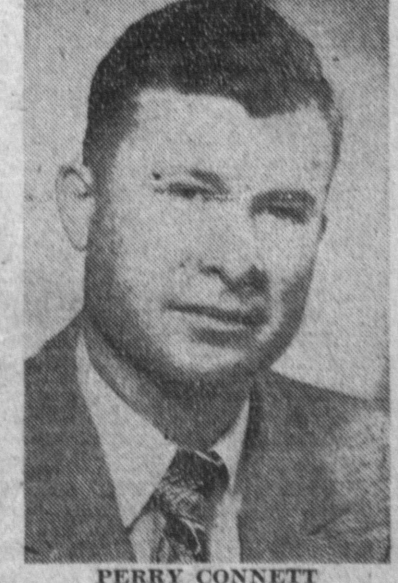
(Story on Page 12)