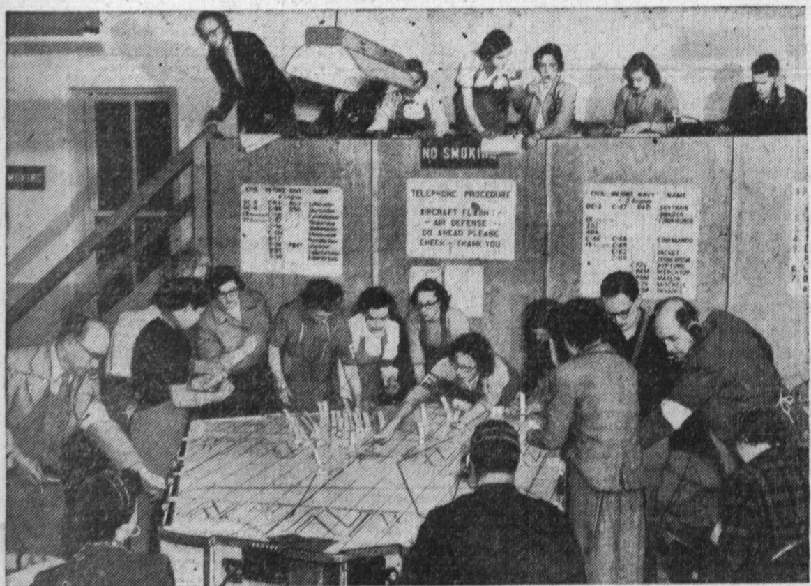
Air Defense Filter Center: Telephone lines link these vital air defense radar posts.