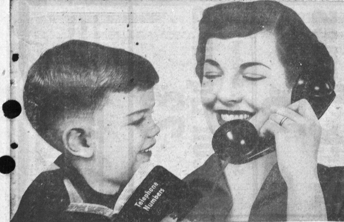
ou keep a list of out-of-town numbers, you'll find calls are put through much faster-often in 30 seconds.