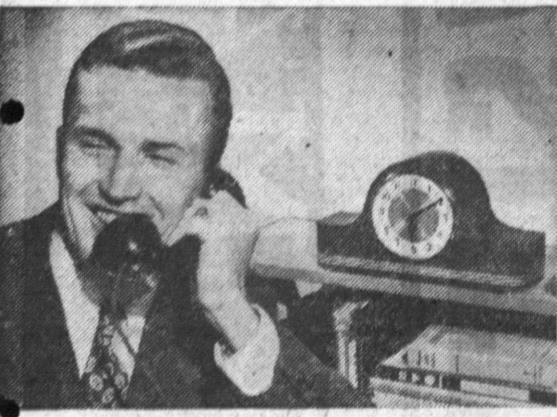
Reduced rates begin at six in the evening . . . and between six and seven is a good time to call. Long Distance rates are low. And nights and Sundays are a particularly fine bargain. For $2.00 or less (plus tax) you can make a station call anywhere in the country. After the first three minutes, time is charged by the minute . . . not as another three-minute period.

Ways to save money and minutes on out-of-town calls