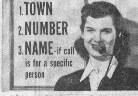
2. For best service, place your call with the operator like this: First, tell her the name of the town you're calling . . . then the telephone number (or the name and address). Next, if it's a person call, give her the name of the one you want to reach. And if you've made notes ahead of time, you'll find you can say as much in three minutes as in an average letter.

3. When you call across the country or across town, you're using a service that's a finer value than ever efore. With your telephone, you can reach twice as many people as 10 years ago. You can call more of the people you want to call . . . more can call you. And at rates that make your telephone a real bargain.