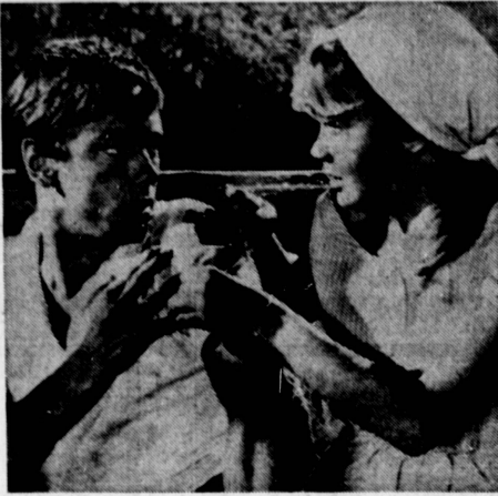
SHOCKING ACCIDENT . . . Charming Hayley Mills is shown with Peter McEnery in a scene from the Walt Disney Technicolor production "The Moon-Spinners" now at the United Artists Theater at Pacific Coast Highway and Crenshaw.