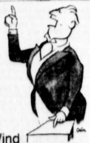
Wind he's got plenty of