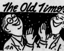
"A good thing to have up your sleeve is a funnybone."

When men abandon the upbringing of their children to their wives, a loss is suffered by everyone, but perhaps most of all by themselves. — Ashley Montagu.