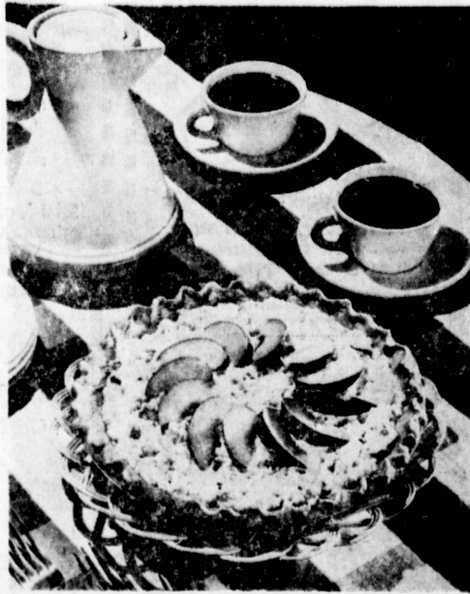
FRESH PLUMS are one of summer's delights to be served for eating out-of-hand. They lend themselves to prepared dishes, too, as suggested here in a spicy crumb pie.